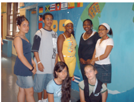
Students from PS89 in the Bronx created a mural.

Use sketches of what your finished project will look like.