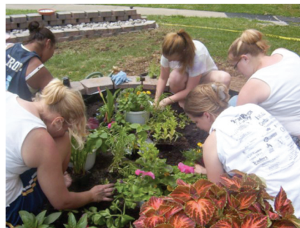
Students at Ripley HS, WV, planted a Memorial Garden.